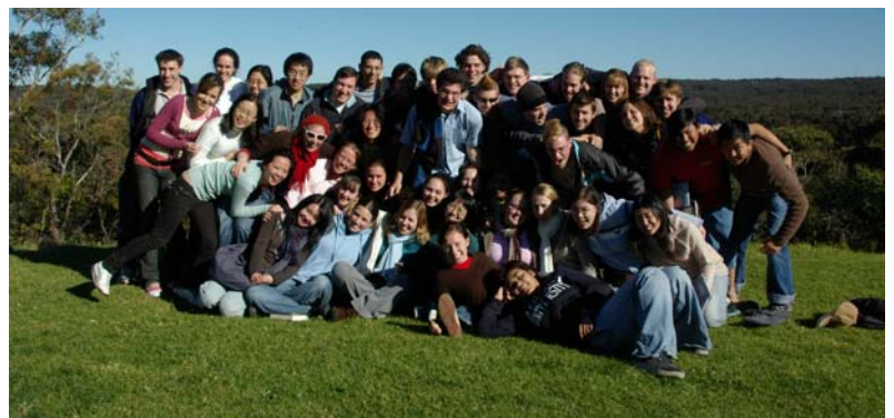
We survived AnCon!