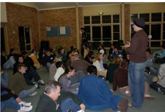
"In Christ's name, I Love Thee"